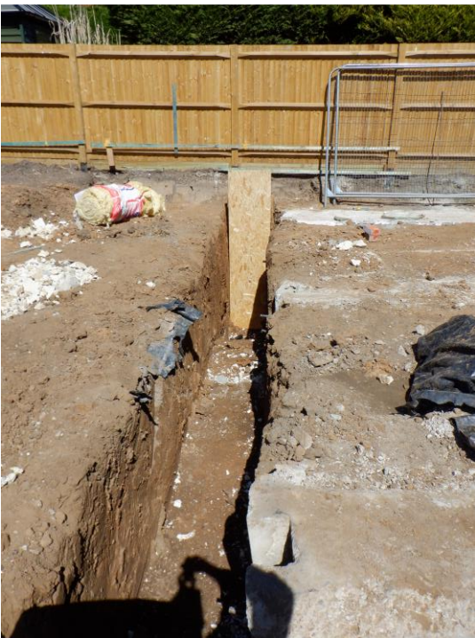
Plate 9. View of foundation trenches (looking NW)