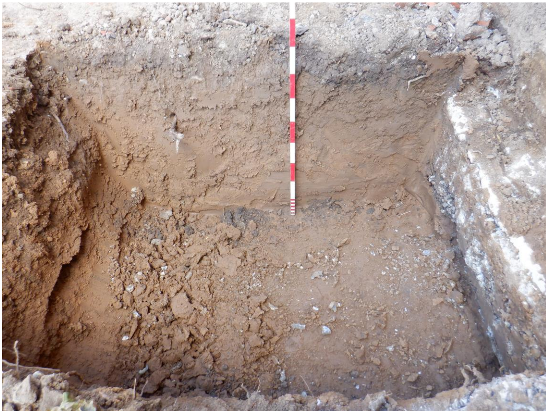
Plate 5. View of completed soakaway