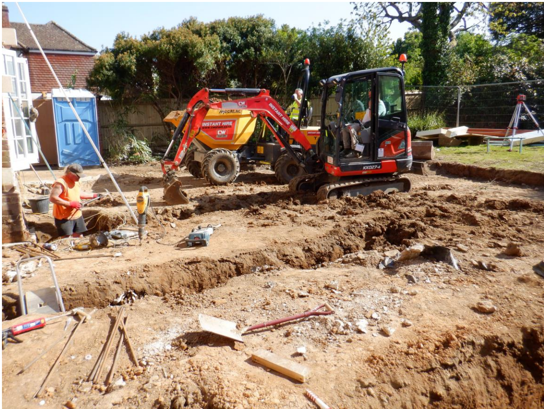
Plate 3. View of foundation trenches (Watching Brief)