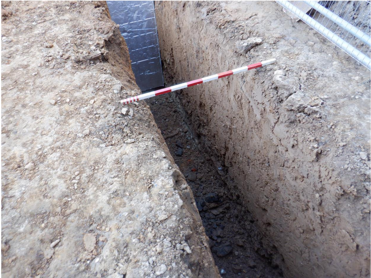
Plates 6. View of foundation trenches (looking NE)