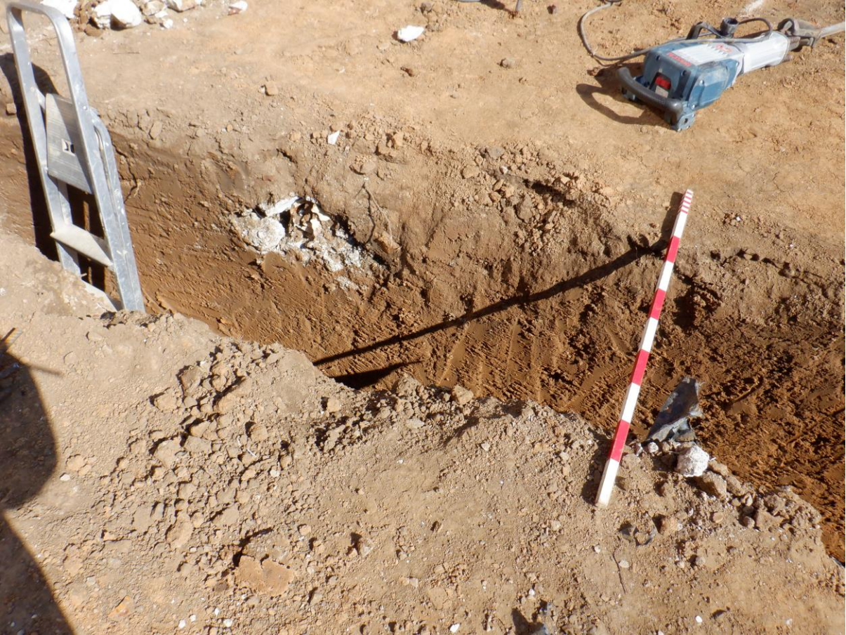
Plate 8. Completed foundation trenches (looking SSE)