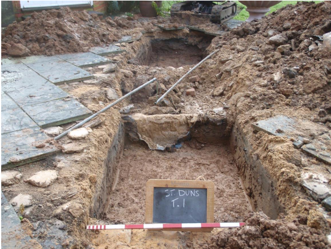
Plate 2. Archaeological evaluation Trench 1