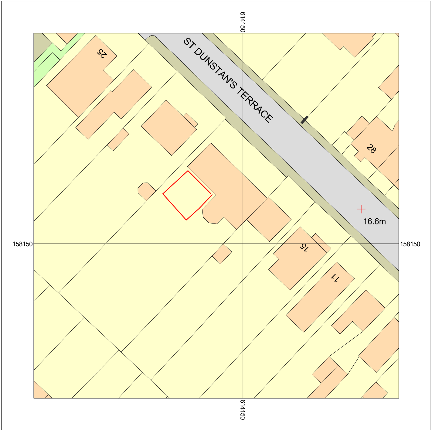
Figure 1. Area watched