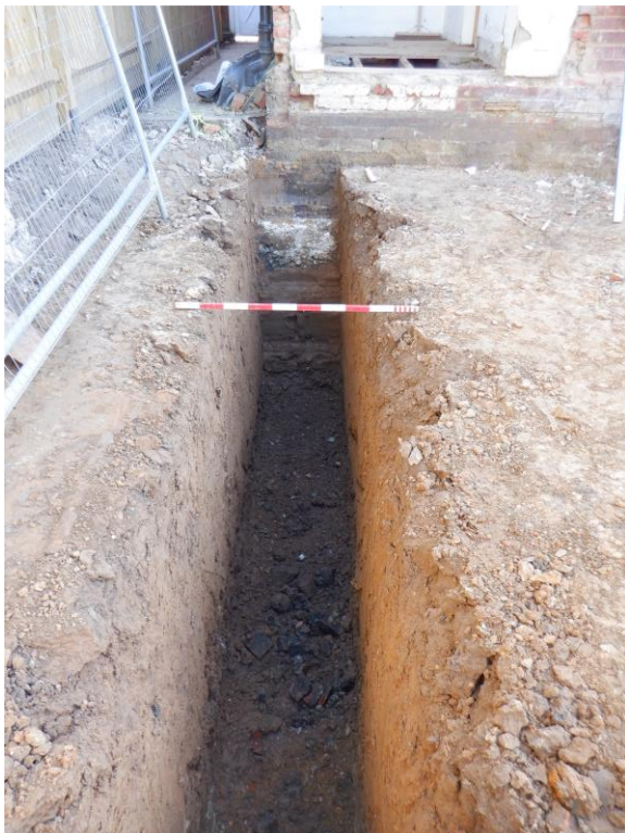
Plate 7. View of foundation trenches (looking E)