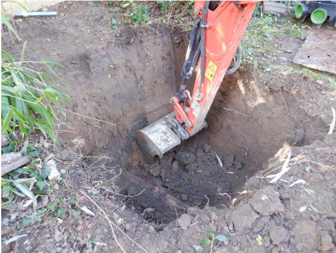
Plate 4. View of drainage soakaway